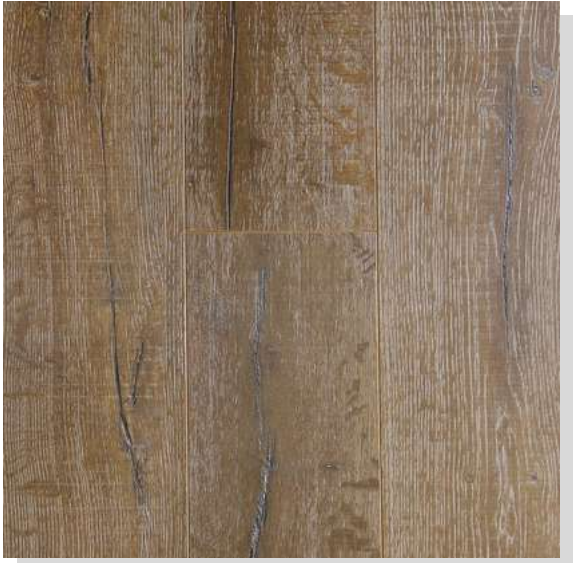
TOFFEE SAPPHIRE R-475, AC 4 1215MM X 193MM X 12MM PLANK SAPPHIRE COLLECTION