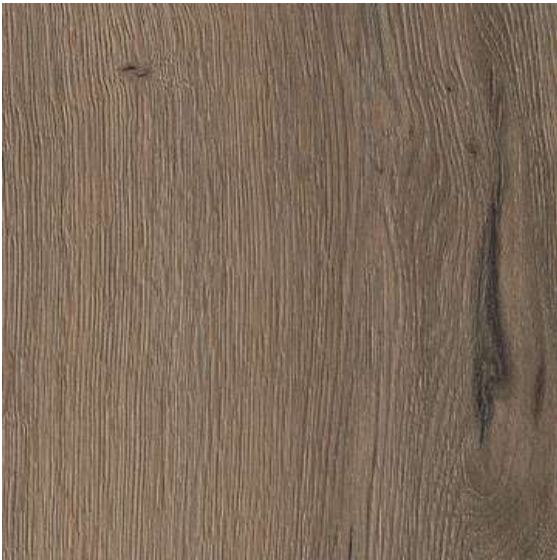
OAK ORLANDO 34242, AC 4 1383MM X 159MM X 10MM PLANK PREMIUM COLLECTION