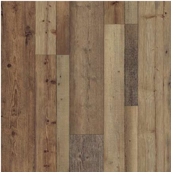
OAK FARCO VIVID K-4366 PINE, AC 4 1383MM X 193MM X 8MM PLANK 3 IN 1 COLLECTION