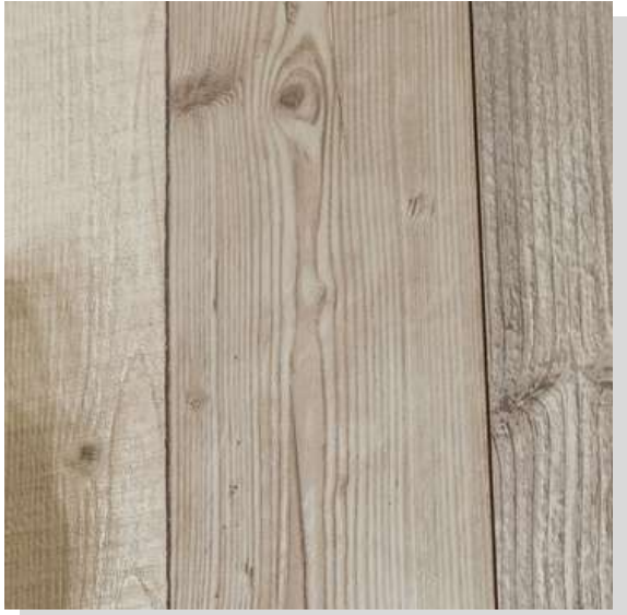
PINE FARCO SPIRIT K-4365 PINE, AC 4 1383MM X 193MM X 8MM PLANK 3 IN 1 COLLECTION