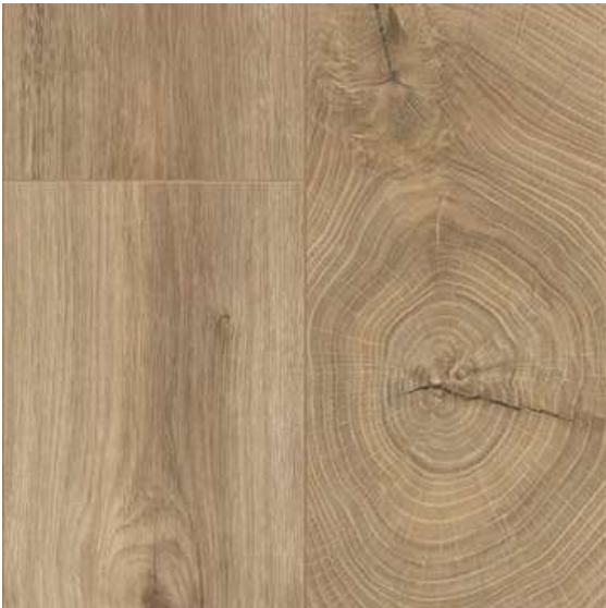
OAK FRESCO LODGE K-4381 OAK, AC 4 1383MM X 159MM X 10MM PLANK PREMIUM COLLECTION