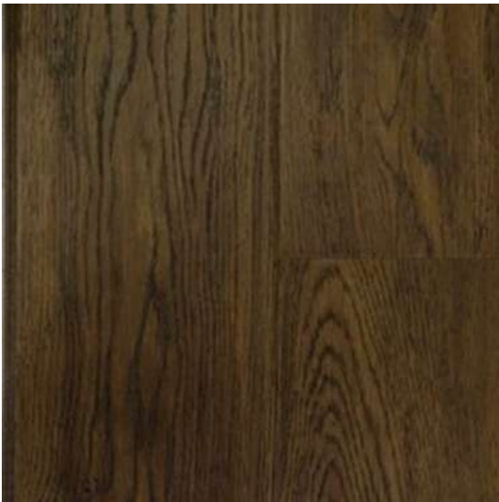
HONEY R-146, AC 4 1213MM X 142MM X 12.3MM PLANK SOHO COLLECTION