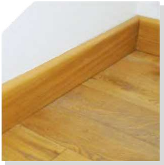
SOLID WOOD SKIRTING