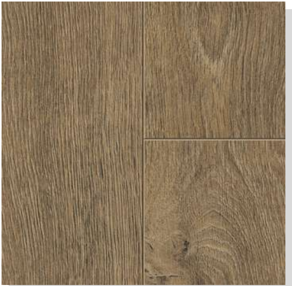
OAK BUFFALO 37267, AC 4 1383MM X 159MM X 10MM PLANK PREMIUM COLLECTION