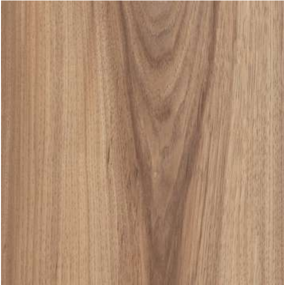
HICKORY VERMONT 37480, AC 4 1383MM X 159MM X 10MM PLANK PREMIUM COLLECTION