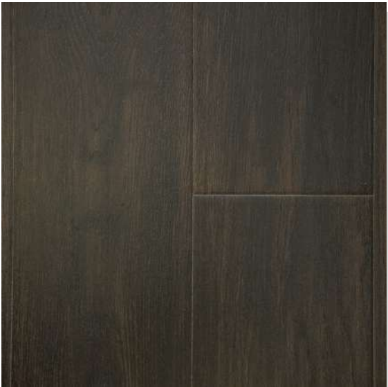
WENGE R-145, AC 4 1213MM X 142MM X 12.3MM PLANK SOHO COLLECTION