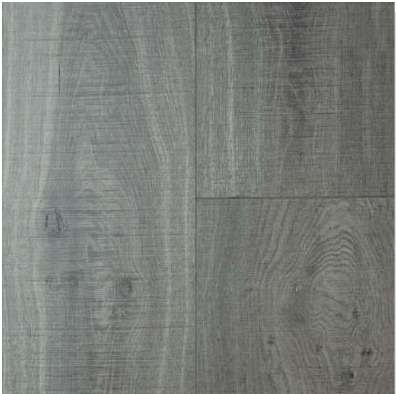
1149 1149, AC 4 1800MM X 238MM X 12MM PLANK ATROGUARD COLLECTION