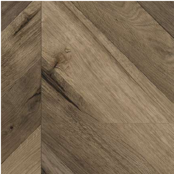
OAK FORTRESS ASHFORD CODE- K 4379 OAK, AC 4 1383MM X 244MM X 8MM CHEVRON FISHBONE COLLECTION