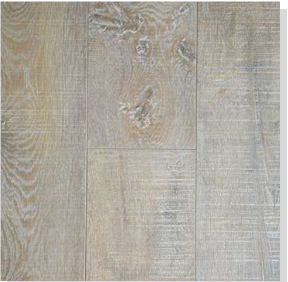
PALERMO CLASSICA R-394, AC 4 1215MM X 193MM X 12MM PLANK CLASSICA COLLECTION