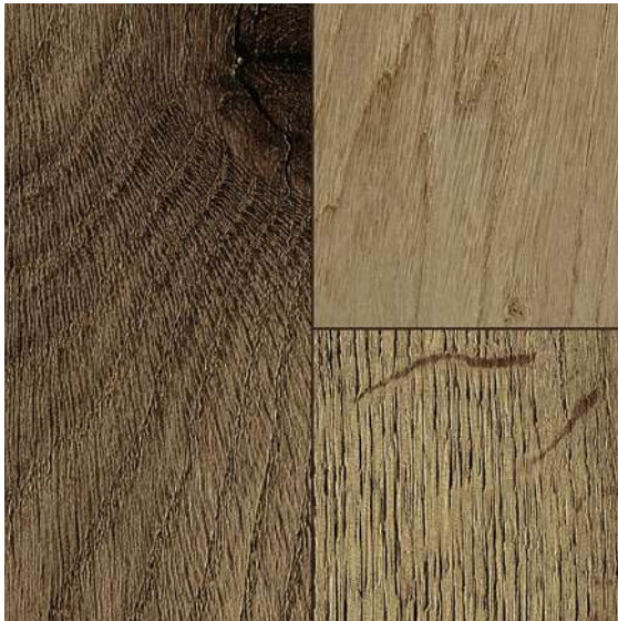
OAK FARCO ELEGANCE K-4362 OAK, AC 4 1383MM X 193MM X 8MM PLANK 3 IN 1 COLLECTION