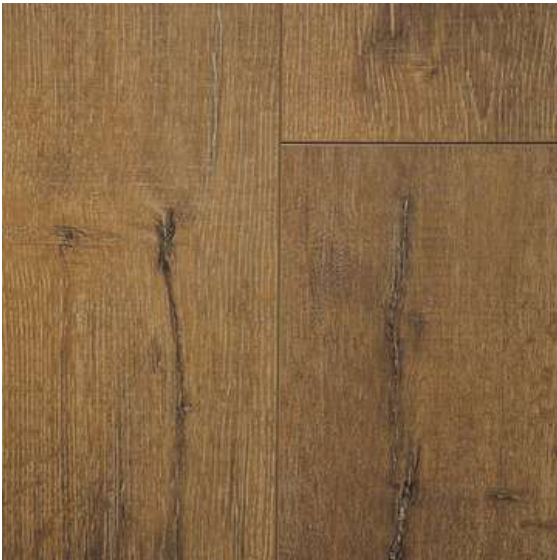
NATURAL SAPPHIRE R-473, AC 4 1215MM X 193MM X 12MM PLANK SAPPHIRE COLLECTION