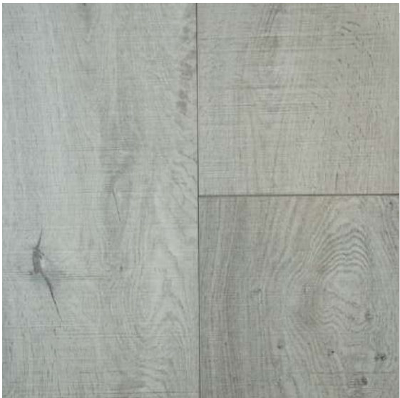
1147 1147, AC 4 1800MM X 238MM X 12MM PLANK ATROGUARD COLLECTION