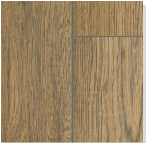
HICKORY CHELSEA 34073, AC 4 1383MM X 159MM X 10MM PLANK PREMIUM COLLECTION