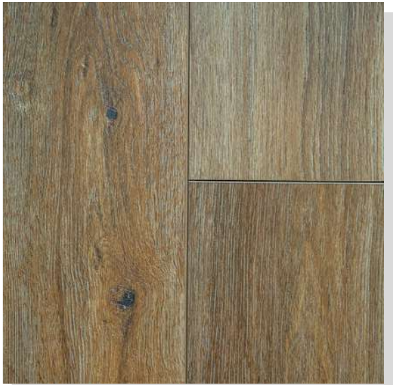
SUNSET RA-11, AC 4 1215MM X 193MM X 12MM PLANK PRAGUE COLLECTION