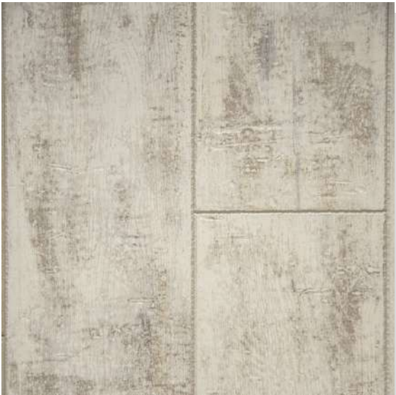
GLIDAS R-750, AC 4 1215MM X 193MM X 12MM PLANK CHURCH COLLECTION