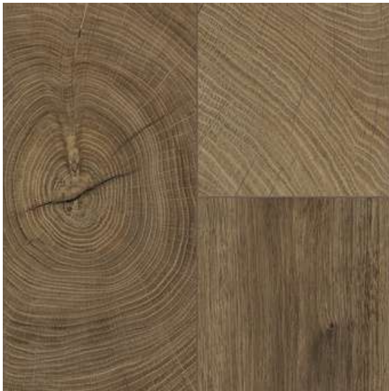
OAK FRESCO BARK K-4382 OAK, AC 4 1383MM X 159MM X 10MM PLANK PREMIUM COLLECTION