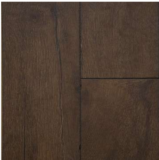
DAKOTA R-765, AC 4 1215MM X 193MM X 12MM PLANK MONTANA COLLECTION