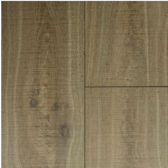
1144 1144, AC 4 1800MM X 238MM X 12MM PLANK ATROGUARD COLLECTION