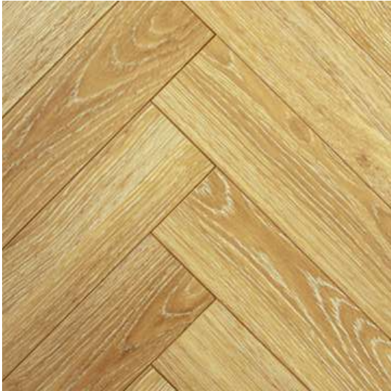
WHITEWASH R-280H, AC 3 600MM X 100MM X 12MM HERRINGBONE HERRINGBONE COLLECTION