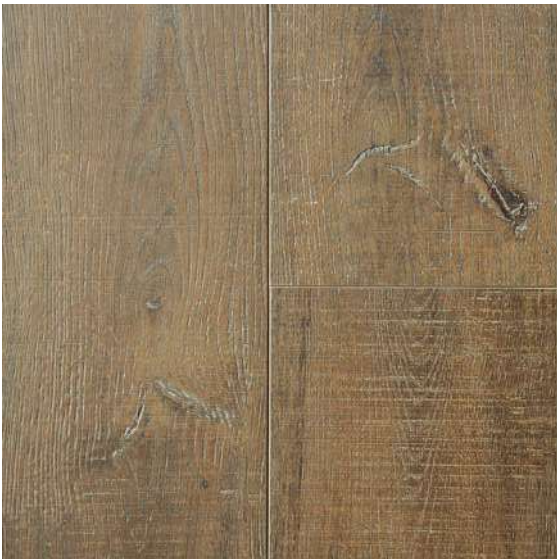
VERANO CLASSICA R-395, AC 4 1215MM X 193MM X 12MM PLANK CLASSICA COLLECTION