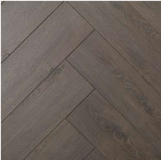
ARONIA OAK 542, AC 6 640MM X 143MM X 12MM HERRINGBONE ALSA HERRINGBONE COLLECTION