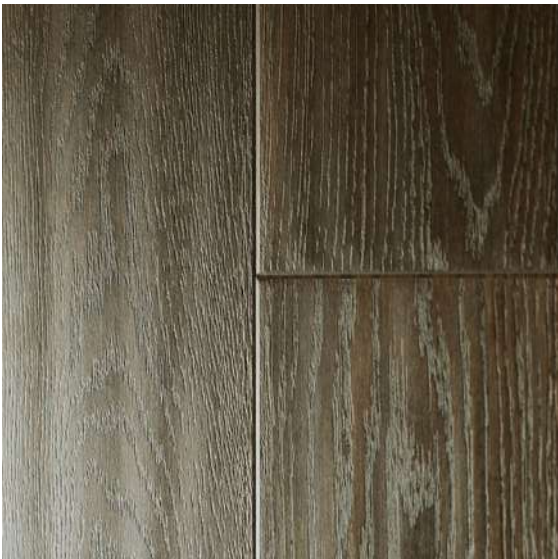
COFFEE OAK R-144, AC 4 1213MM X 142MM X 12.3MM PLANK SOHO COLLECTION