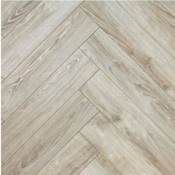
SARDINIA OAK 619, AC 6 640MM X 143MM X 12MM HERRINGBONE ALSA HERRINGBONE COLLECTION